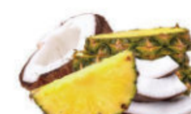
Piña Colada Piña Colada