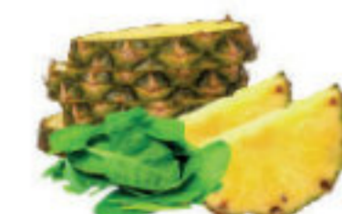
Pineapple-Spinach Piña - Espinaca